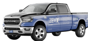
Ram 1500 Any cab configuration