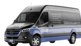
Sprinter 2500/3500 Cutaway, cargo, & passenger